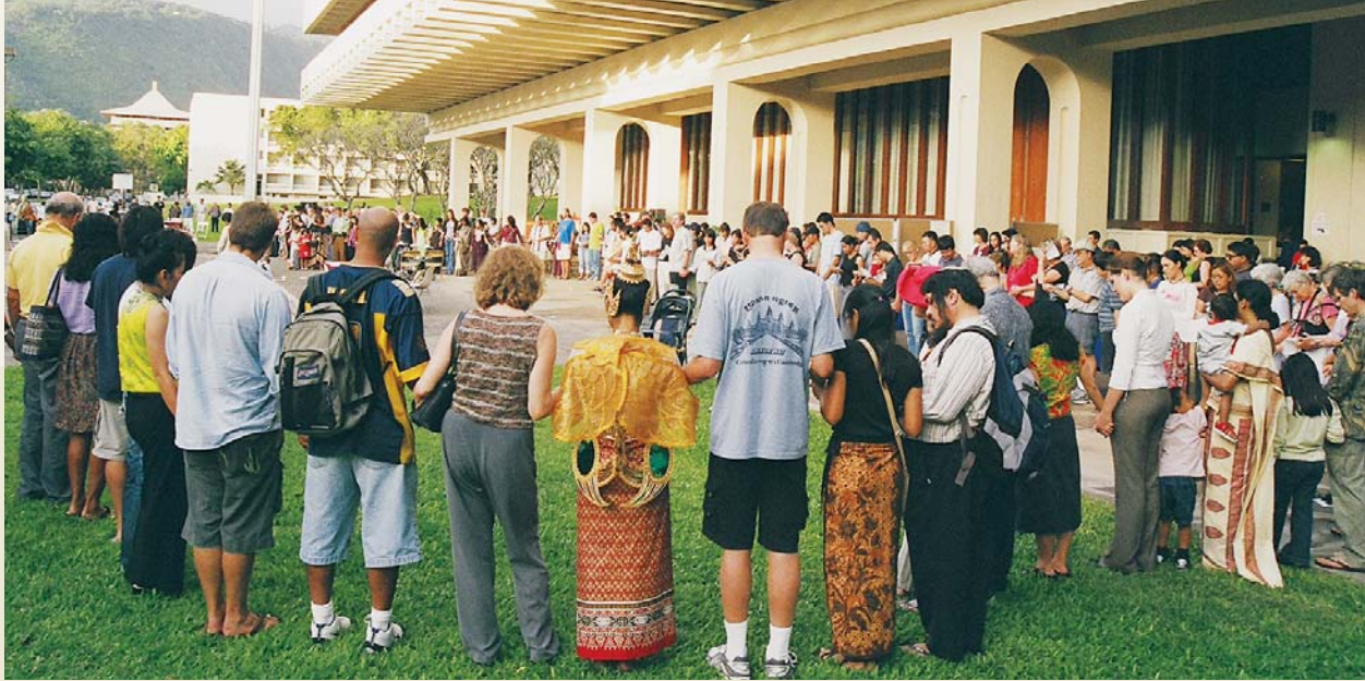
Following the Dec. 26 tsunami, hundreds gathered at the Imin Conference Center at Jefferson Hall to express their support for victims of the tragedy.

THE EAST-WEST CENTER was established by the United States Congress in 1960 to “promote better relations and understanding between the United States and the nations of Asia and the Pacific region through cooperative study, education, and research.” To support this mission, the Center’s programs focus on a specific institutional goal—to assist in creating an Asia Pacific community. Research, dialogue, educational activities, and public outreach incorporate both the Center’s mission and the programmatic focus of building an Asia Pacific community.