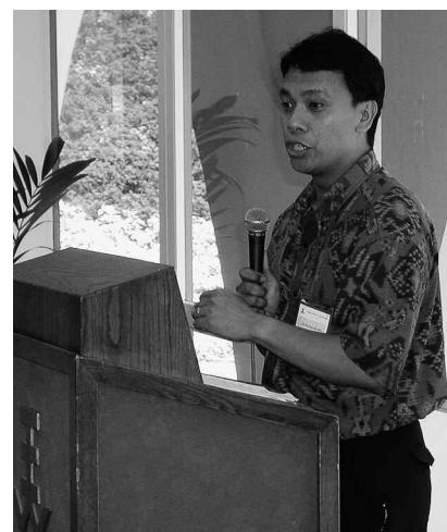
Philippine Congressman and EWC alumnus Nereus Acosta addresses the President's Roundtable discussion.