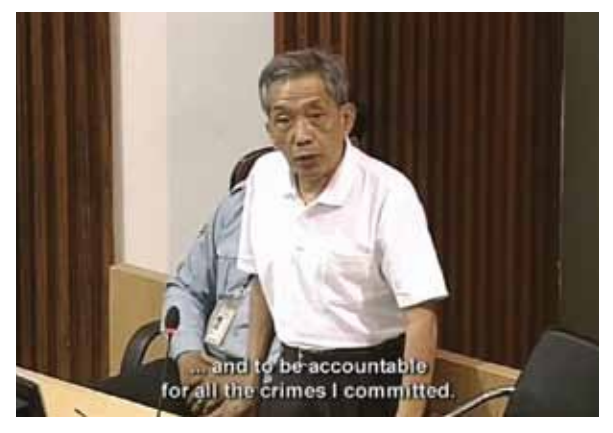
Kaing Guek Eav, alias "Duch," faces the court on the popular television series Duch on Trial, a weekly program in Cambodia broadcasting trial summaries and commentary.

While the Khmer Rouge trials are historically significant, the proceedings themselves were always expected to be very lengthy and, in many respects, arduous. Important testimony is punctuated by procedural arguments, and the ailing health of several of the accused shortens some of the ECCC's sitting hours and lengthens the trial as a whole. The Cambodian public would likely find watching the proceedings for more than a few hours difficult. Further, most Cambodians are unlikely to follow daily hour-long live broadcasts, and even if they did, most of what they would see would likely appear obscure without commentary. The main idea of the new TV program was therefore to create a weekly half-hour film series, which would explain the cases to a layperson audience by focusing public attention on key issues relating to accountability and explaining fair trial rights. AIJI and KMF decided to use a talk show format, with well-known journalists as moderators