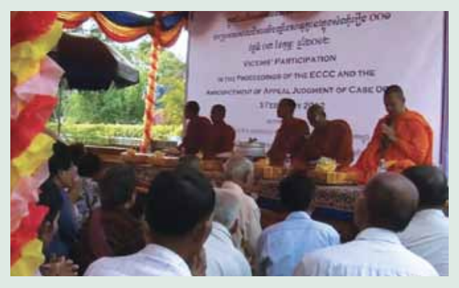
Community members, civil parties, and victims gather in February 2012 to discuss the Case 001 Appeal Judgment.