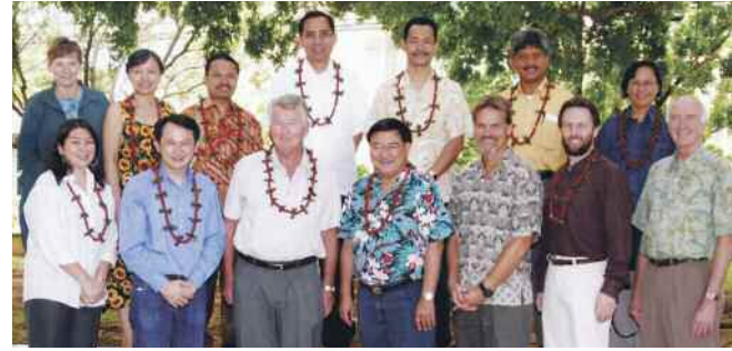
A planning meeting for the new Asian Studies in Asia program was held at the East-West Center in August.

In addition, ASDP this fall presented workshops for U.S. college and university faculty at Georgia