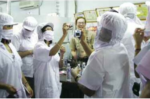
Journalists received first hand information from health care workers in the field.