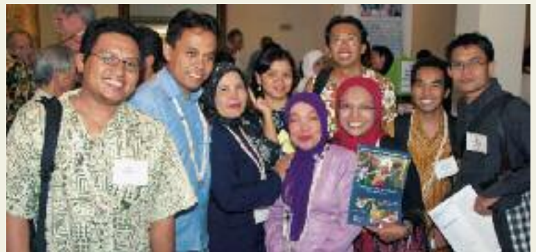
Our colleagues from Indonesia enjoyed the conference.