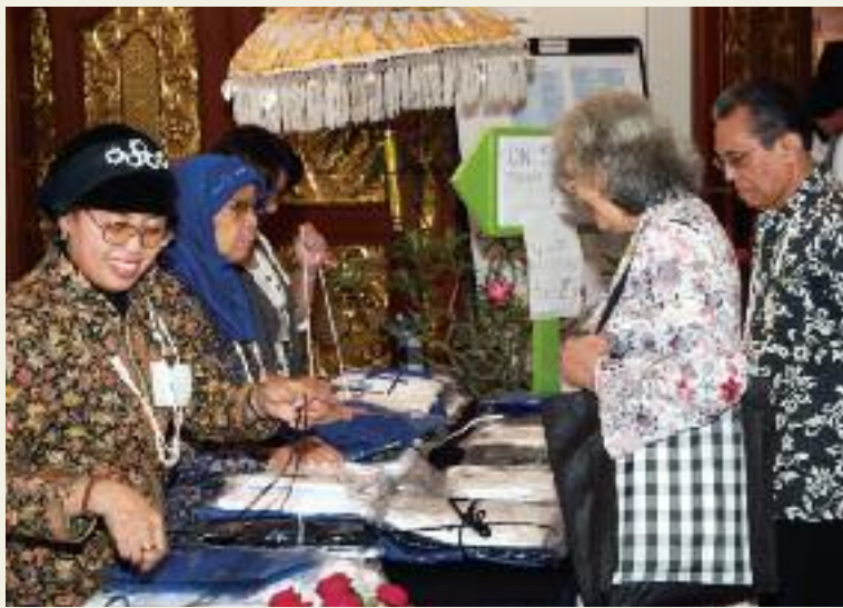
Lots of special souvenirs were available.