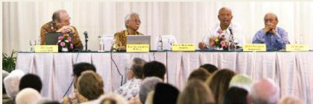
Plenary panel on philanthropy.