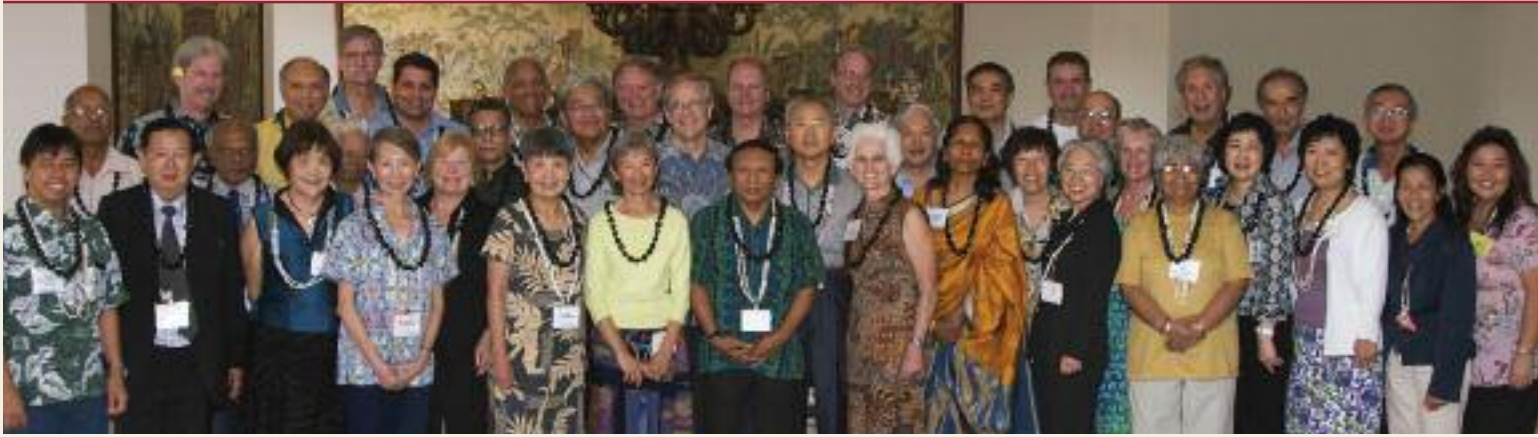
Chapter leaders from 31 chapters met at a two-day workshop prior to the conference.