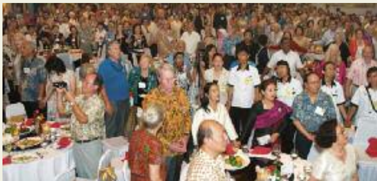
Always lots of good food and fellowship at our conferences.