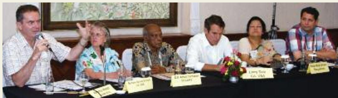
Alumni from several countries discussed climate change.