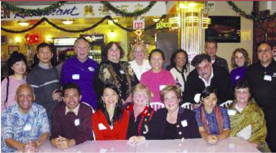
Members of the Southern California Chapter gathered for a Holiday Party.