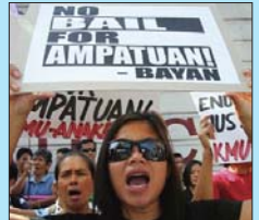
No let up for the protesters in showing their disgusts and sentiments.

HAWAII FILIPINO CHRONICLE 94-356 WAIPAHU DEPOT RD., 2ND FLR. WAIPAHU, HI 96779