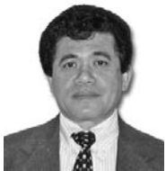
by Reuben S. SEGURITAN

are in the U.S. may be able to file their adjustment of status and employment authorization applications while those who are processing their immigrant visa applications abroad may be scheduled for visa interview.