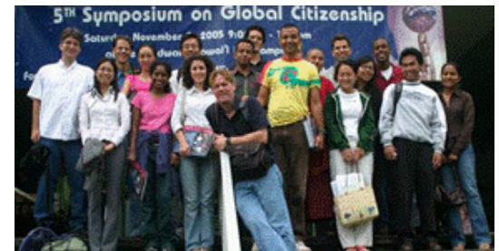
Members of the Service Learning & Leadership Class (Fall 2005) participating in the Global Citizenship Symposium.

The economist John Kenneth Galbraith once wrote that all great leaders have one thing in common: "The willingness to confront unequivocally the major anxiety of their people in their time." Balancing the more historical approach of Film & Leadership, this course will examine modern leadership theories and how contemporary leaders "confront" the challenges of their time and fulfill the needs of their particular followers. Students will have the opportunity to research, interview and profile contemporary leaders, including EWC alumni in Asia Pacific, and develop leadership case studies. These profiles and case studies will eventually be published on an internet site and form a databank to be utilized by all leadership education students at the EWC.