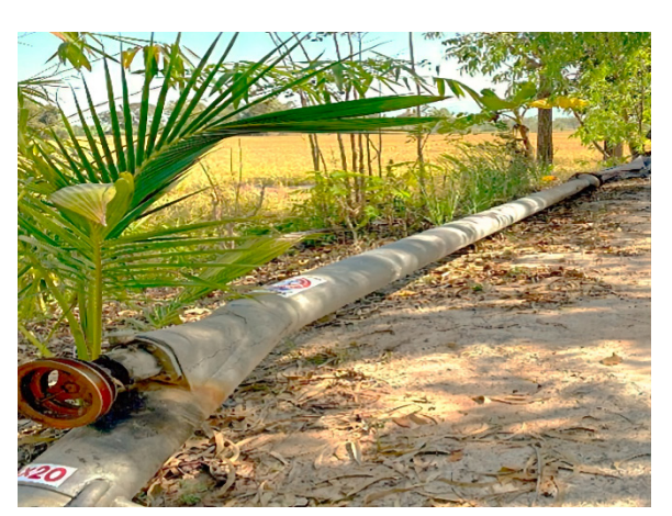
A water pumping machine (left), and its connecting pipe made of heavy metal.

who depend on rice farming as their primary income source. Also, farmers in Nong Ma Mong District of Chainat engage in rainfed rice farming because they lack access to irrigation systems. When faced with floods, farmers in this province rely on water pumping machines to drain the water out of their rice fields. When the water levels are extremely high, the nearby water reservoirs and canals lack the capacity to take up additional water from rice fields. Consequently, the fields become inundated.