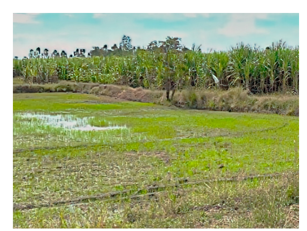
Left: rice farmer selling fruits along Chao Praya River in Chainat. Right: sugarcane cultivation alongside rice paddies.

men. Others raise small or large livestock (ducks, goats, cows, and buffaloes) or work fish farms. In Uthaithani, many raise cows and buffaloes raising, along with trading cattle and buffalo manure to either supplement or replace their rice earnings since these activities are less sensitive to climate variability and shocks and are more lucrative than rice farming. Many farmers use parts of their rice fields to grow other crops, such as banana, bean, corn, dragon fruit, cassava, eucalyptus, mango, or sugarcane. In Ayutthaya, which is part of Thailand's industrial estates and factory zones, many rice-farming households supplement their rice income by sending other household