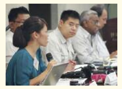
In July, EWC invited participants from NGOs and media in South Korea and other Asian nations to a three-day training program on accurately reporting human rights issues . The discussions focused on ethics and techniques for developing credible human rights reports. ◆ EastWestCenter.org/Zk5

The Center continued to break new ground in 2014 with its seminar programs for journalists , including the fourth biennial EWC International Media Conference held in Yangon, Myanmar, in March. More than 500 media professionals from 31 countries attended the conference in the emerging nation that until just a few years ago had some of the most repressive media controls in the world. Also during the year, EWC media programs conducted a workshop in Seoul on reporting on human rights issues and a reunion conference of Pakistani media alumni in Islamabad that addressed issues of youth at risk in the country. \leq EastWestCenter.org/journalismfellowships