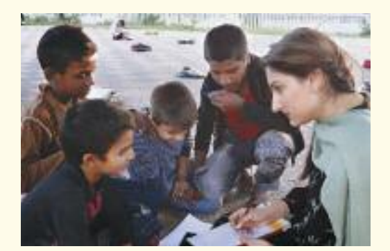
Pakistani journalists from across the country gathered in October to reflect on the future of media in Pakistan at an alumni conference for EWC's Deepening Democracy through Media in Pakistan project. With support from the U.S. Embassy in Islamabad, the four-year project was designed to promote free and fair media and to help bridge gaps in understanding between the U.S. and Pakistan. ◆ EastWestCenter.org/ZkS