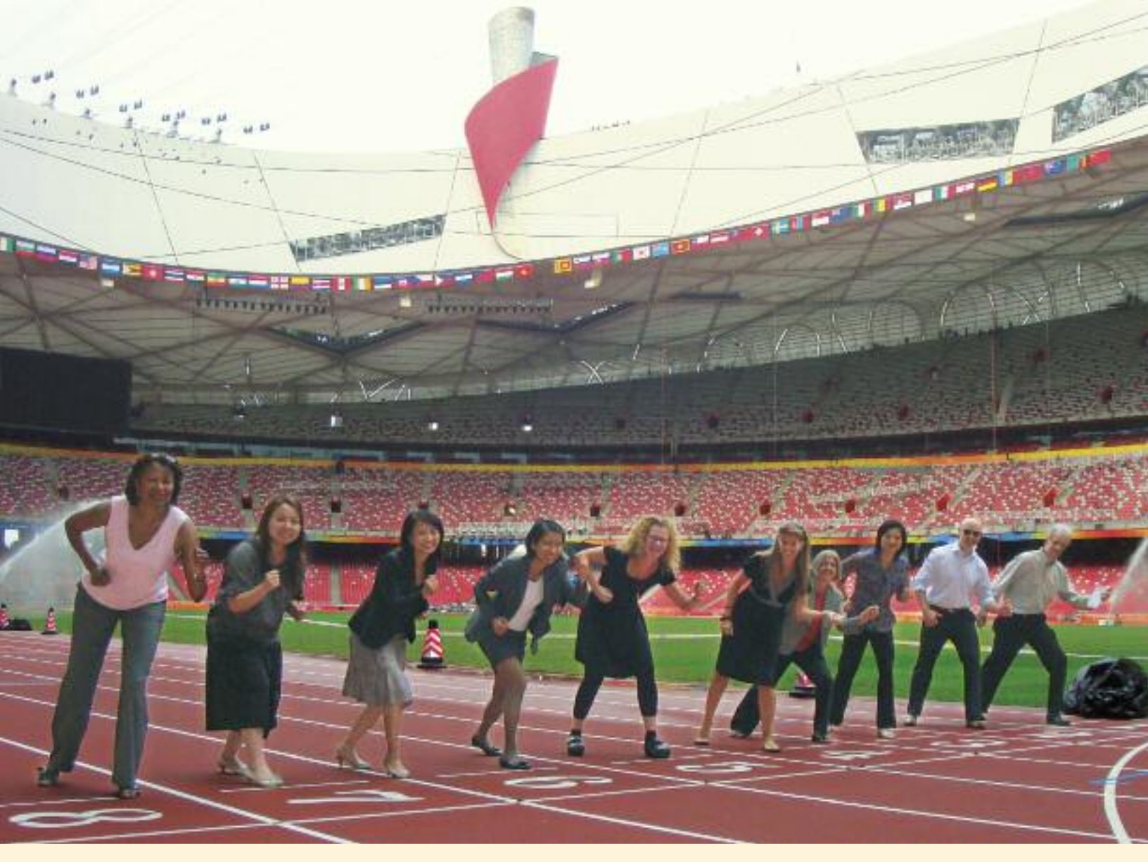
EWC's Hong Kong Journalism Fellows take their place at the starting line in the 2008 Beijing Olympic 'Bird's Nest' stadium.

The East-West Center was established by the United States Congress in 1960 to "promote better relations and understanding between the United States and the nations of Asia and the Pacific region through cooperative study, education, and research."