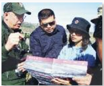
Participants in the China Protected Areas Leadership Alliance Project discuss conservation strategies with a U.S. park ranger.

The Senior Journalists Seminar "Bridging Gaps between the United States and the Muslim World" included the first EWC media program participant from Iran.