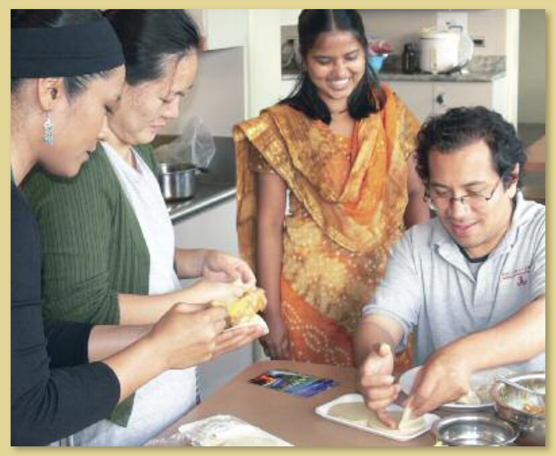
EWC student fellows share cross-cultural culinary traditions in the Center's Hale Manoa residence hall.

The East-West Center promotes better relations and understanding among the people and nations of the United States, Asia, and the Pacific through cooperative study, research, and dialogue. Established by the U.S. Congress in 1960, the Center serves as a resource for information and analysis on critical issues of common concern, bringing people together to exchange views, build expertise, and develop policy options.