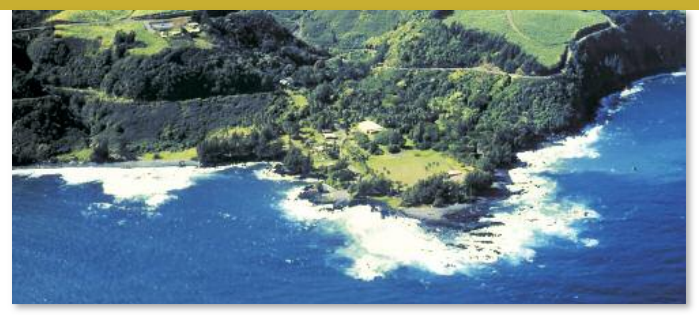
Sea level rise will exacerbate erosion and other coastal hazards, threaten vital infrastructure, and thus compromise the well-being of island communities. The Pacific RISA program provides critical support to Pacific island communities in mitigating and adapting to the effects of climate change.