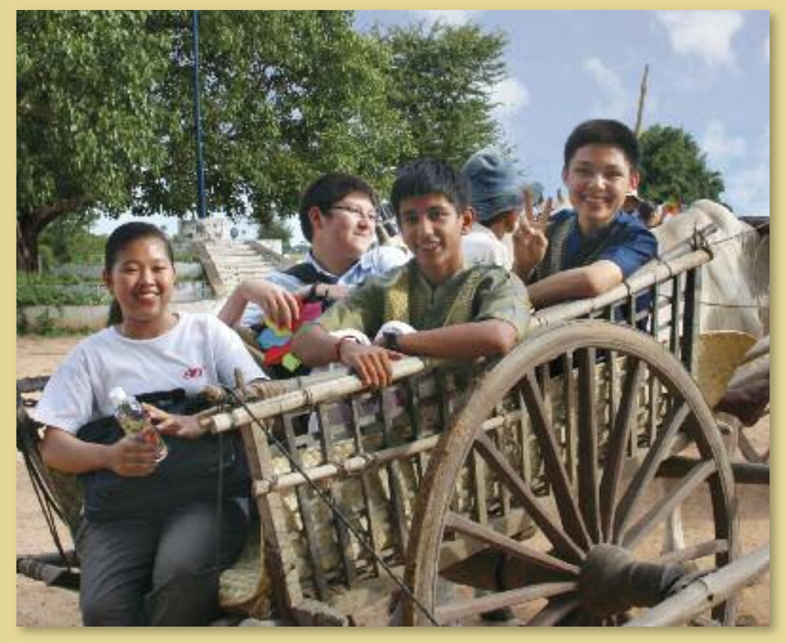
American high school students in AsiaPacificEd's Partnership for Youth (P4Y) program experience daily life in rural Cambodia.