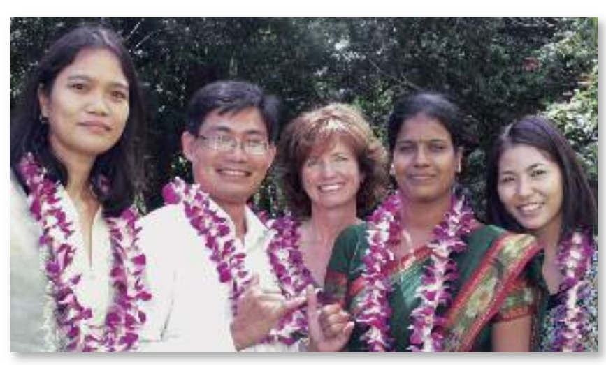
2009 EWC Association Alumni Scholarship Recipients

Produced in 2009, The East-West Center at 50: The Case for Support describes the impact of private giving and outlines the Center's funding priorities — opportunities to help the Center meet the increasing demands of the next 50 years. Naming opportunities and permanent recognition for all donors of $50,000 or more are among the incentives for strengthening private philanthropy as the Center's mission of building a peaceful, prosperous and just Asia Pacific region becomes more essential than ever.