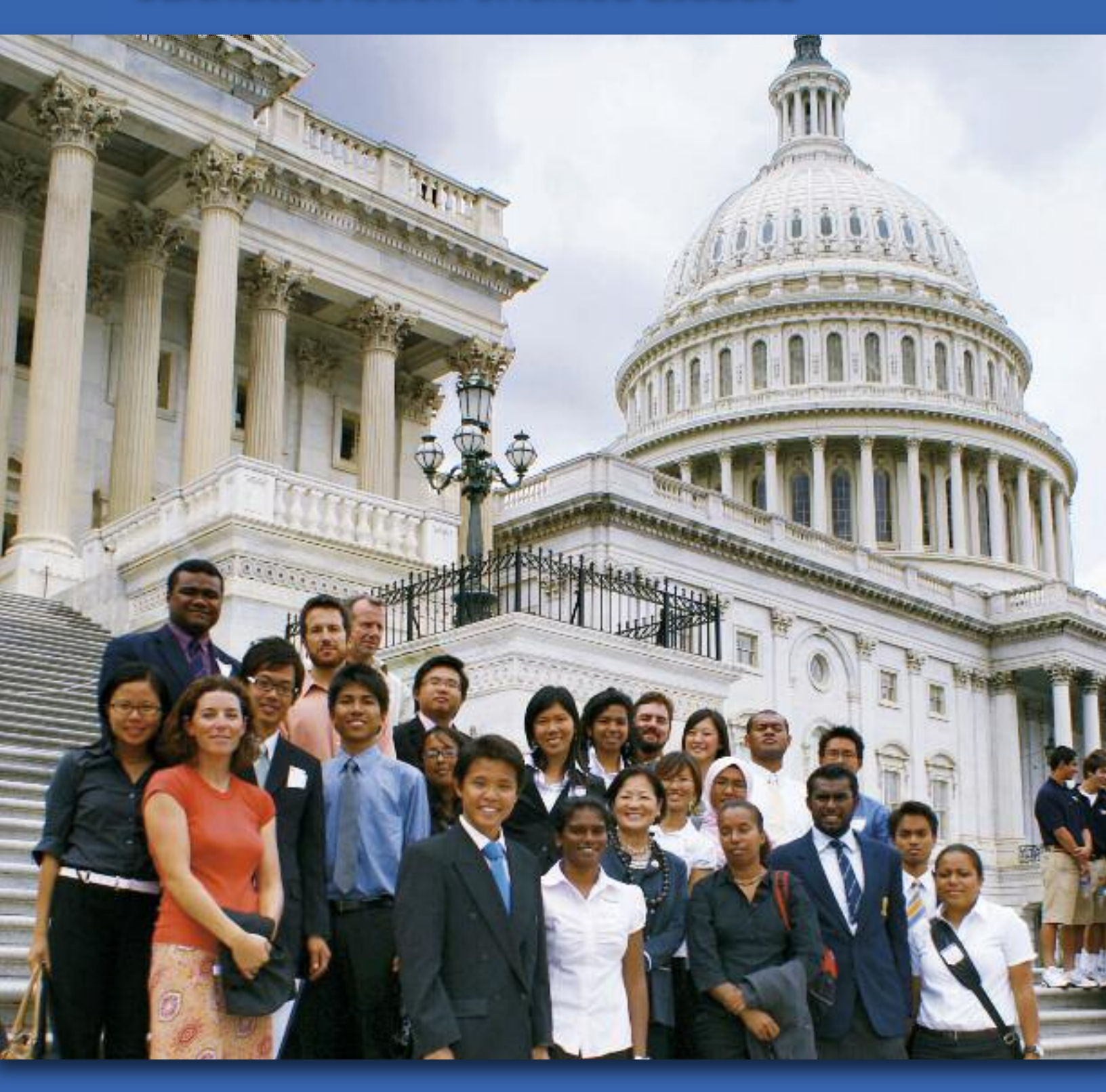
USIE participants with Hawai'i Congressional Representative Mazie Hirono on Capitol Hill.