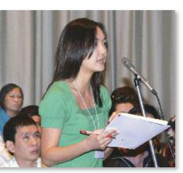
The International Graduate Student Conference, an annual student-led initiative and the largest of its kind worldwide, attracted 140 students from 54 universities in 25 nations.

In FY2009 the number of EWC students rose to 540, the highest since 1974. This was driven by a growing variety of public and private scholarship funding streams, with total of 14 at present, including the first from the Norway Research Council, supporting Pacific islands students, and the Ministry of Education and Training in Vietnam. An increasing number of students also fund