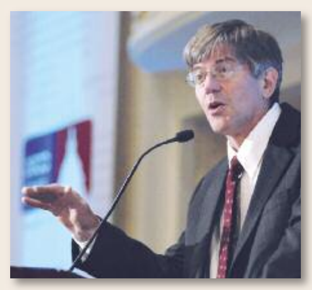
Deputy Secretary of State James B. Steinberg

The survey of opinion leaders from 25 Asia Pacific economies was conducted in April 2009 and is part of PECC's State of the Region Report. Respondents overwhelmingly agreed that slower growth in Western industrialized countries for the foreseeable future would encourage a shift to domestic demand growth in Asian economies.