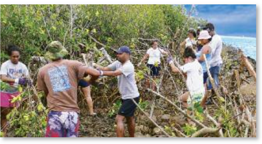
U.S.-South Pacific Scholarship Program alumni helped restore a Native Hawaiian fishpond during their week-long leadership and social networking workshop in Honolulu.

their own participation in East-West Center programs as affiliated students and scholars, to access the rich intellectual and cultural environment at the Center. The chart below depicts student diversity by region.