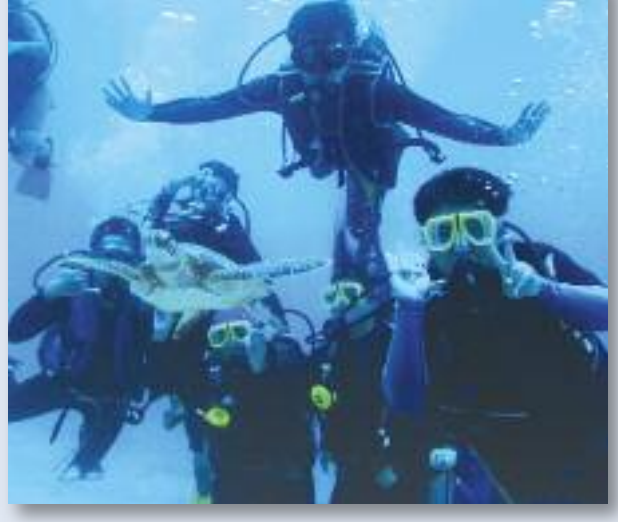
USIE participants look at Hawai'i's marine ecology issues first-hand during a deep sea dive.

During the field study in Washington D.C., following a week meeting with scientists and environmental leaders in the San Francisco area, participants examined how effective policies tested by individual states are then adopted at the national level. While in the capital, participants met with members of U.S. Congress leading environmental committees that create policies, officials who enforce the policies at the U.S. Environmental Protection Agency, and professionals who defend or challenge policies at the Natural Resources Defense Council.