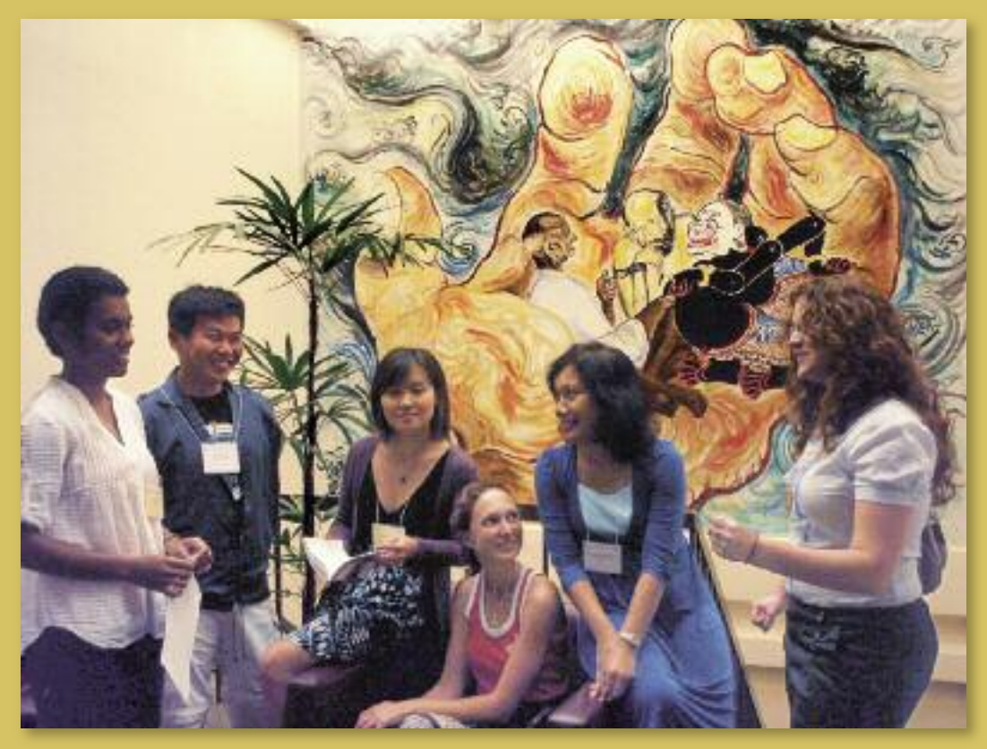
At the International Graduate Student Conference, EWC student fellows from Fiji, Indonesia, Mongolia, and the U.S. discuss regional issues in front of the newly restored "Wisdom of the East" mural by Javanese master painter Affandi, part of the East-West Center's Permanent Collection.