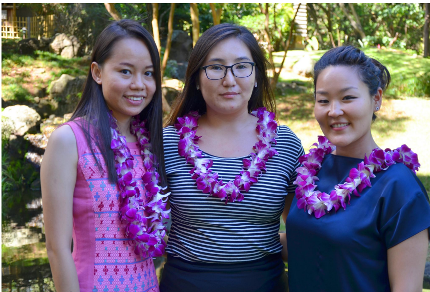
2017 ADB-JSP Cohort