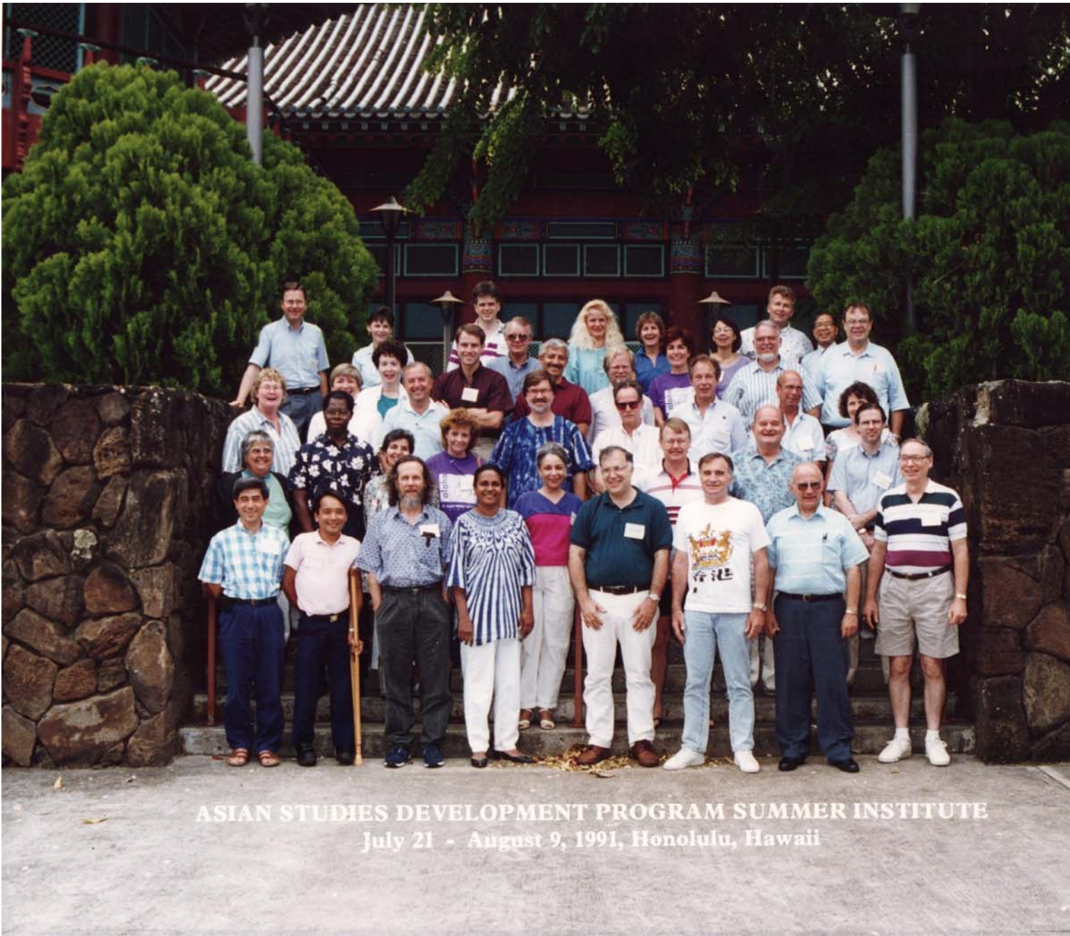
This is a group photo of the first ASDP three week Summer Institute in 1991. A modest prize goes to the person who can identify the most participants.