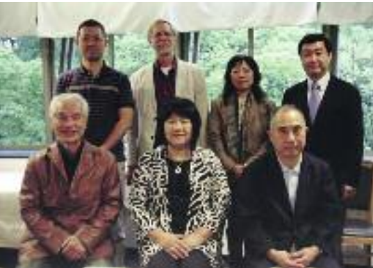
Members of the Kansai chapter approved by-laws at a recent meeting.