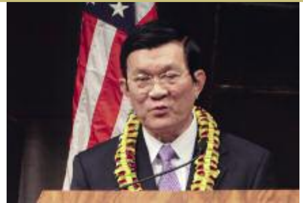
Vietnam President Sang spoke at the EWC on Nov. 11th.

Malaysian Prime Minister Najib Razak spoke at the EWC on Nov. 12th.