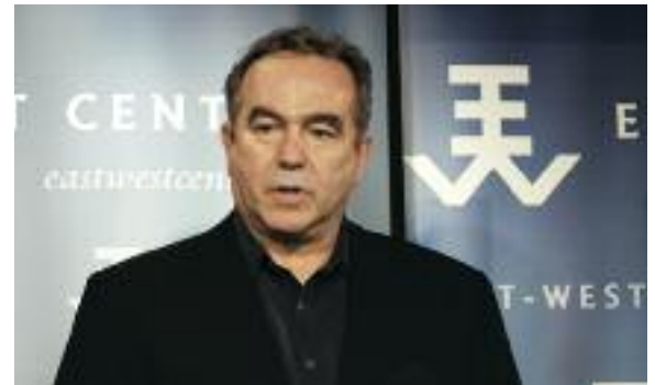
Kurt M. Campbell

The United States and China held their inaugural round of U.S.-China Asia-Pacific Consultations at the East-West Center in late June. Delegations were headed by U.S. Assistant Secretary of State for East Asian and Pacific Affairs Kurt M. Campbell and Chinese Vice Foreign Minister Cui Tiankai .