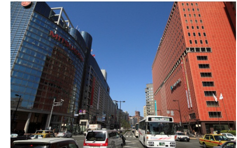
Tenjin (day 9)

We will leave the busy city for the historical Dazaifu City. We will go to Dazaifu Tenmangu Shrine where students come from all over Japan to pray that they succeed in their studies and exams. We will also go to the nearby Komyozenji Temple and the Kyushu National Museum.