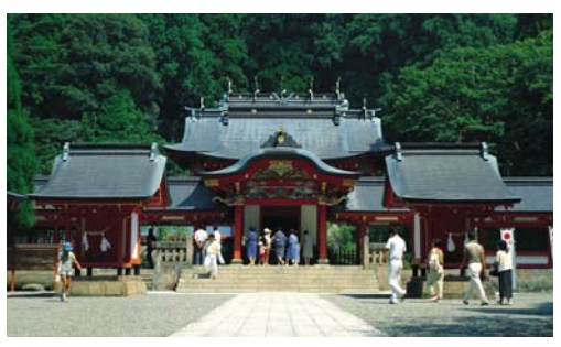
Kirishima Shrine (day 1)

Please join us for the a special post-conference tour of Kyushu – the third largest island of Japan. The EWCA Alumni Endowment Fund for Student Scholarships Committee has organized this tour and it starts in Okinawa the day after the EWC Alumni Conference ends and includes the major sites of the island of Kyushu. The tour concludes on September 30, 2014 in Fukuoka City.