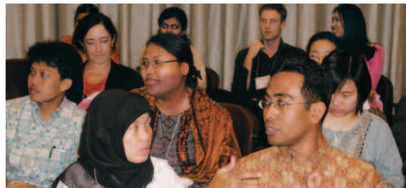
Students representing 14 countries and more than 50 universities attended the EWC International Graduate Student Conference.