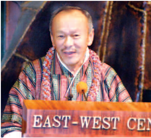
Lyonpo Jigmi Yoser Thinley