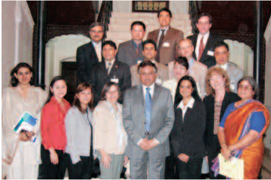
Winter 2006 EWC Jefferson Fellows with Pakistan President General Pervez Musharraf at his headquarters in Rawalpindi.

Pakistan President General Pervez Musharraf told a group of international journalists that it was time to resolve the dispute over Kashmir. "The people of Pakistan, India and Kashmir want peace," he said. "I feel Kashmir is ripe for resolution. The earthquake brought us closer together."