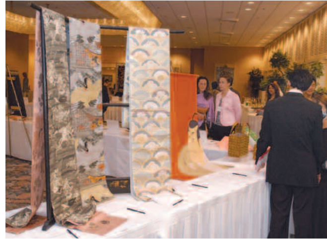
Silent Auction and International Bazaar raised over $35,000.