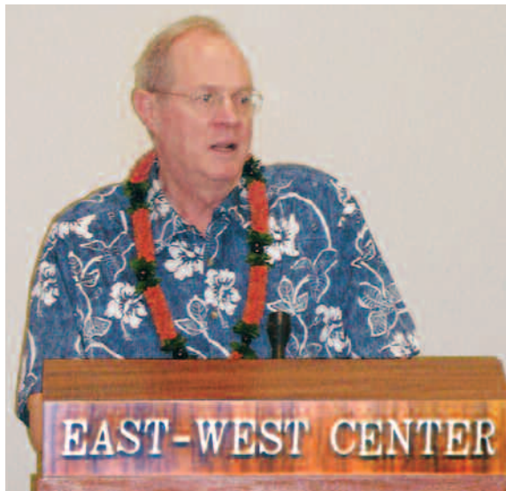
U.S. Supreme Court Justice Anthony Kennedy

Acknowledging the multinational makeup of his audience, Kennedy said, "There are certain universals regarding the concept of justice and we all have the obligation to understand and debate them together."