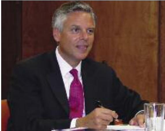
U.S. Ambassador to China Jon Huntsman visited the East-West Center in August enroute to his new post in China.

EWC Foundation/ Friends of Hawaii Charities $10,000