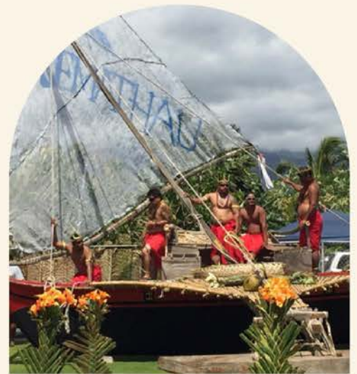
Remathau Community members

The initial connection between the Mill and Wodde Jippel was initiated in 2020 as Wodde Jippel members wove banonoor (coconut frond baskets) for an art installation in the exhibition Inundation: Art and Climate Change in the Pacific. This growing relationship with Wodde Jippel led to the development of weaving classes and meaningful opportunities for sharing and cultural exchange.