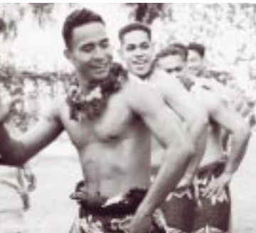
Members of the 'Atenisi troupe from Tonga perform at the EWC.