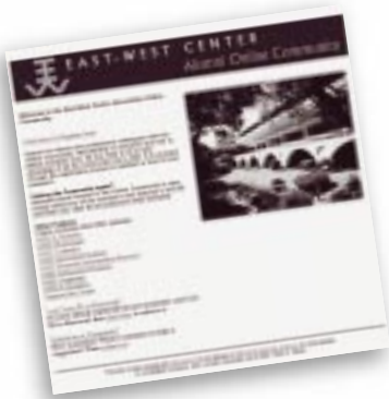
The EWCA On-Line Community webpage.

The East-West Center Association set up a new On-Line Community Website which includes an on-line directory, message boards, permanent e-mail addresses, broadcast e-mail, and career services including mentoring and yellow pages for members.