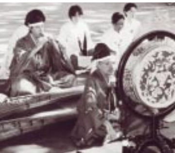
The concert of "Japanese Court Music and Dance" attracted an enthusiastic audience.